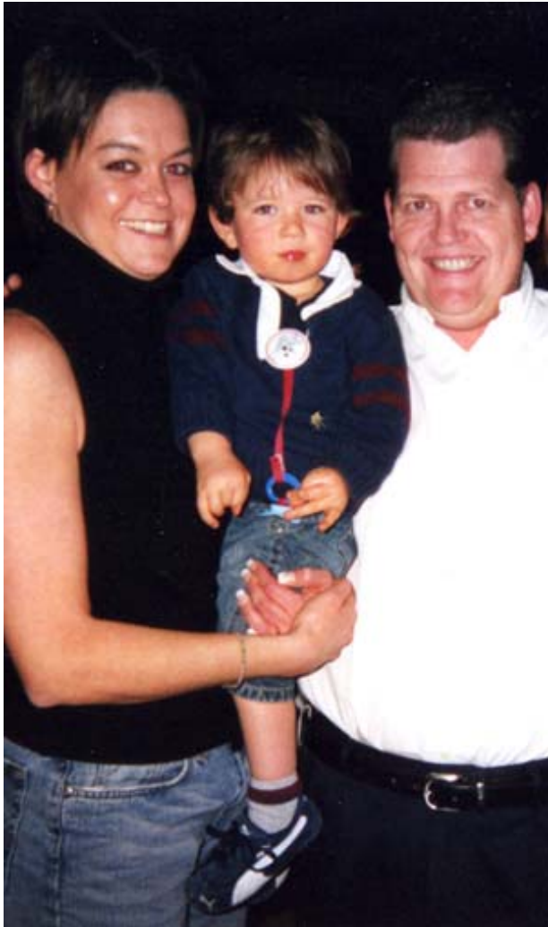
We are crazy about our nephew, who is also adopted.

Our child will be given room to grow and the discipline to guide. We would encourage choices of many activities and support each one. In addition to that, we would spend time nurturing our child with our extended families, helping our child understand the importance of this aspect of life.