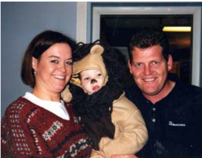
Halloween with our nephew

Prior to marriage, Russ and some of his friends purchased some land in the country. They constructed a cabin and machine shed. They use it frequently as a place to “get away” from the day-to-day activities. They use the tractor to plant food plots for the wildlife and overall upkeep of the farm. The cabin has all the modern amenities and other than location, feels like a second home. Being around nature is a great source of happiness for him. The farm is about 35 miles from home.