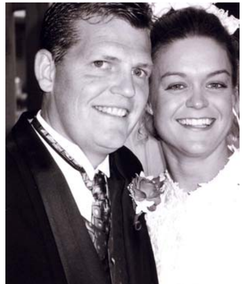
The beginning – Our Wedding 9-19-1999