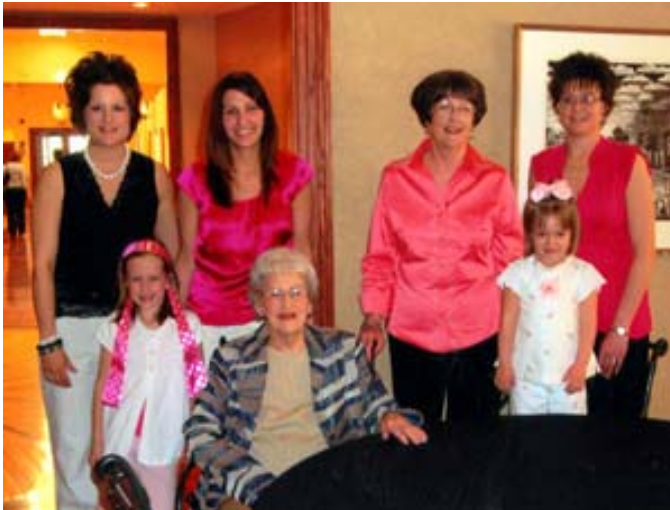
All the ladies in the family