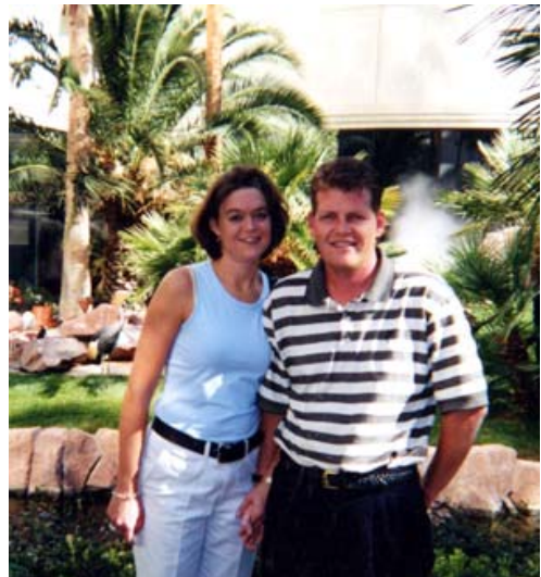
Honeymoon in Jamaican Gardens

We look forward to having a child in our home. We feel that the best way to raise a child is with understanding, compassion and love. We plan to use experiences from our childhoods, along with our life experiences to give our child the best possible chance for success and happiness.