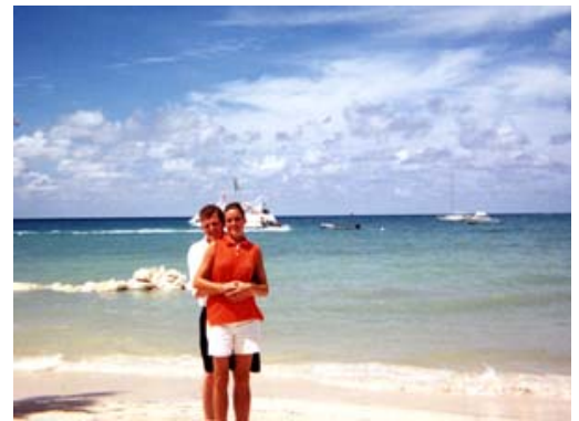
Vacationing in Florida