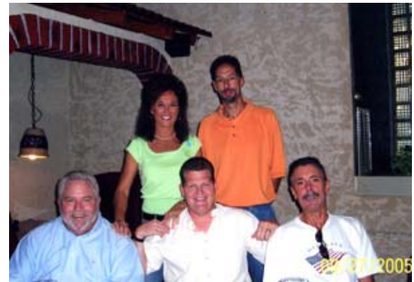
Close friends enjoying Mexican Cantina

He wanted a “normal” work schedule and found it as a salesman. He is currently a top salesman for his company and finds that there is “extra” time to go on walks, play golf and travel with his best friend and wife. While working as a salesman, we have made new and wonderful friends and have enjoyed getting together with them for dinner or traveling to Kansas City, St. Louis and the Lake of the Ozarks.