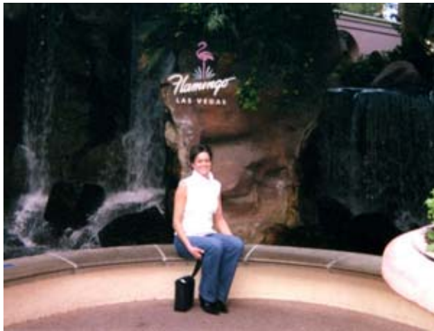
“Viva” Las Vegas